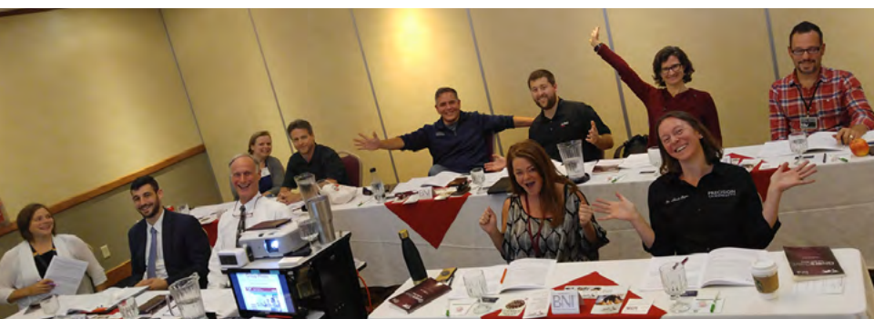
October Member Success Program Graduates.

Tuesday, December 5, 1:00 – 4:00 pm Location: Holiday Inn, South Burlington