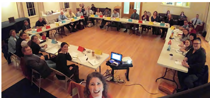
First Quarter Leadership Round Table.

Remember to thank your Leadership Team for their hard work!