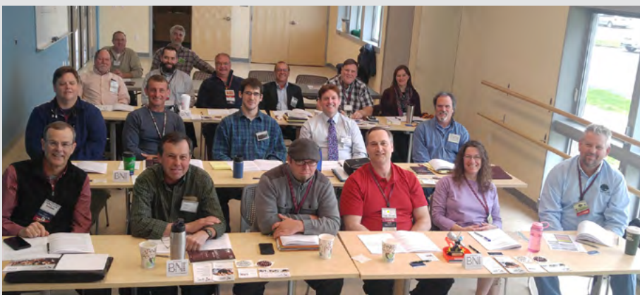
Middlebury Chapter MSP Graduates.

Friday, June 19, 5:00 – 8:00 pm Location: Bevo Roosevelt Highway, Colchester