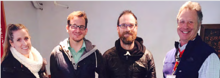
February 2017 Member Success Program Graduates.