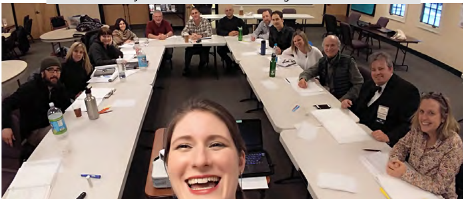
Advanced Member Success Program Graduates.