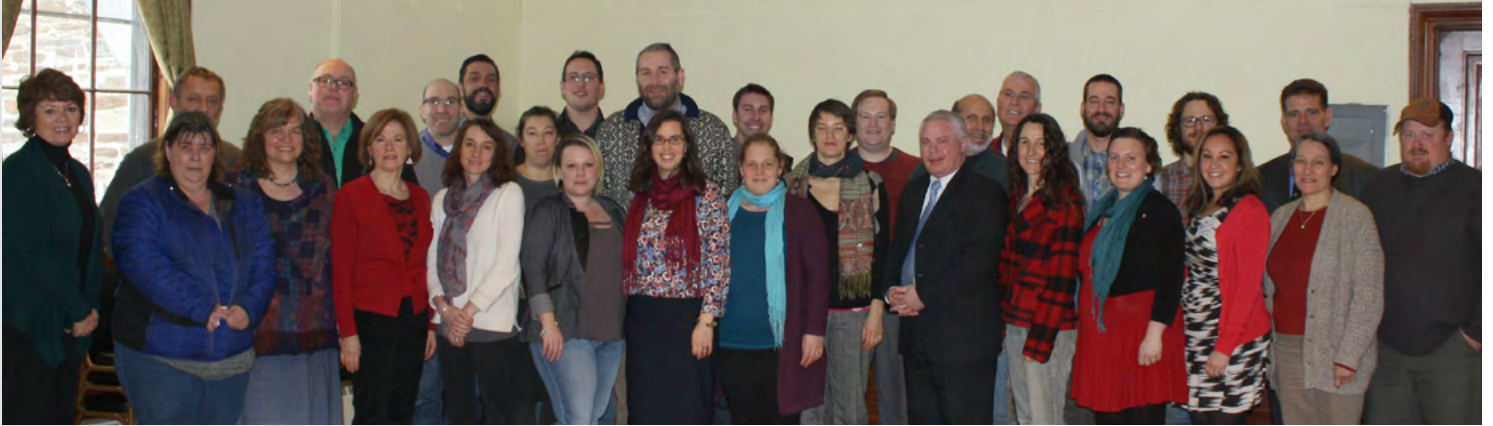
A Huge Welcome to Our Newest Members of Heart of Vermont BNI in Montpelier. Vermont's newest chapter is set to launch Friday, February 24!