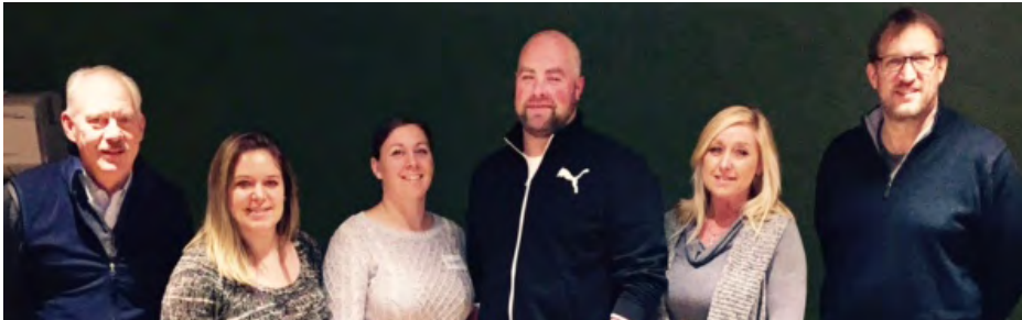
January 2017 Member Success Program Graduates.

Thursday, March 16, 5:00 – 8:00 pm Location: Bevo Roosevelt Highway, Colchester